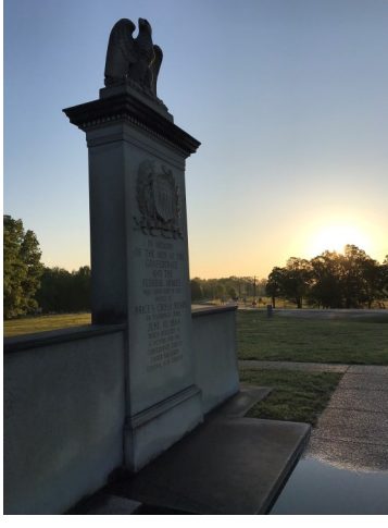
Brice's Crossroads National Park

Brice's Crossroads is a National Park site, nestled between Shiloh to the north and Vicksburg to the south. While the Battle of Brice's Crossroads is well known, the tiny 1.1-acre park site is relatively unknown. Large amounts of land around the NPS site have been purchased for preservation, but the battlefield lacks coherent interpretation and has had minimal upkeep and visitor-use enhancements over the last two decades. Whereas other preservation efforts struggle against urban development, Osborne sees Brice's Crossroads' biggest threat as apathy at the local leadership and community engagement levels. So, he launched the Brice's Crossroads Foundation in November 2022, and looks to follow it with a possible Round Table. The Foundation's mission is to support the interpretation and educational opportunities that deal with Civil War issues in North Mississippi. Osborne sees the opportunity to use the